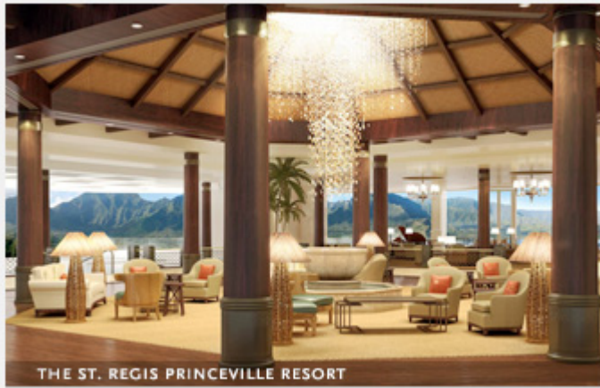
THE ST. REGIS PRINCEVILLE RESORT