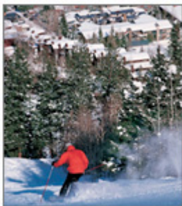
THE ST. REGIS ASPEN RESORT

For more information please visit our website at www.stregis.com