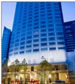
THE ST. REGIS SINGAPORE

For more information please visit our website at www.stregis.com