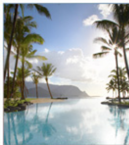
THE ST. REGIS PRINCEVILLE RESORT