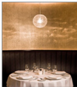
THE ST. REGIS WASHINGTON, D.C.

The Hanalei package includes overnight accommodations; daily breakfast for two guests and welcome amenity. From $490 per night. To book this commissionable package in GDS search the promotional or package rates for "St. Regis Opening Party", available online at www.stregis.com and enter your IATA number or contact St. Regis Reservations at 1-877-STREGIS and ask for rate plan "LOCPKG2".