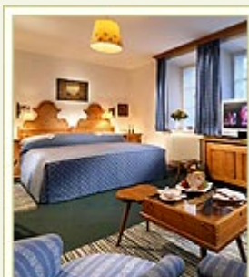
Hotel Goldener Hirsch, Austria

Exclusives includes daily full breakfast and room tax. Rates from $320 per night with a three-night minimum. A complimentary fourth night for stays in July and August 2008. To book this commissionable package in GDS enter Chain Code LC and search the promotional rates for Taste of Luxury, available on luxurycollection.com and enter your IATA number or contact The Luxury Collection Reservations Desk at 1-800-325-3589 and ask for rate plan "TASTE".