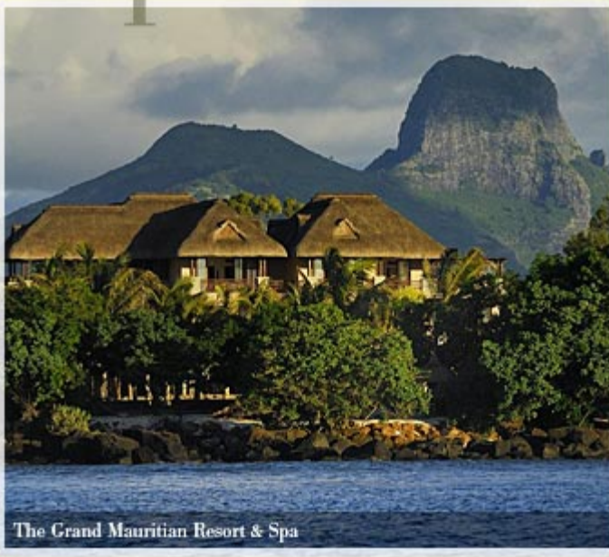
The Grand Mauritian Resort & Spa