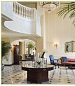
The Fairfax at Embassy Row, Washington, D.C.