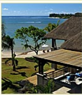
The Grand Mauritian Resort & Spa

For more information visit www.luxurycollection.com