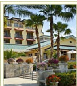
The Diplomat Golf Resort & Spa, Hallandale Beach