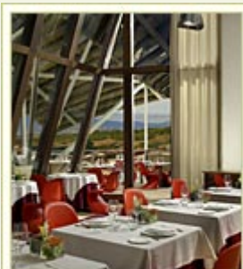
Hotel Marqués de Riscal, Spain

Exclusive includes one resort credit of $75 per room , per stay. Rates from $289 per night with a two-night minimum. To book this commissionable package in GDS enter Chain Code LC and search the promotional rates for In City Getaway Package, available on luxurycollection.com and enter your IATA number or contact The Luxury Collection Reservations Desk at 1-800-325-3589 and ask for rate plan "LOCPKG1".