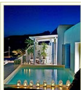
Santa Marina Resort & Villas, Greece

For more information visit www.luxurycollection.com