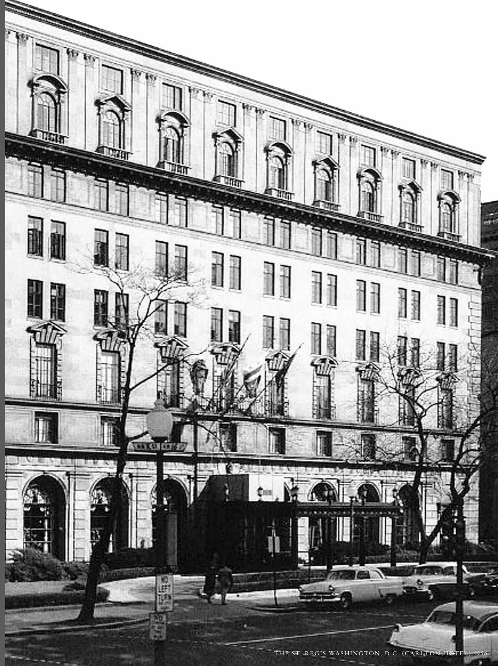
THE ST. REGIS WASHINGTON, D.C. (CARLTON HOTEL) 1956