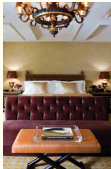
Right page bottom ST. REGIS SUITE BEDROOM