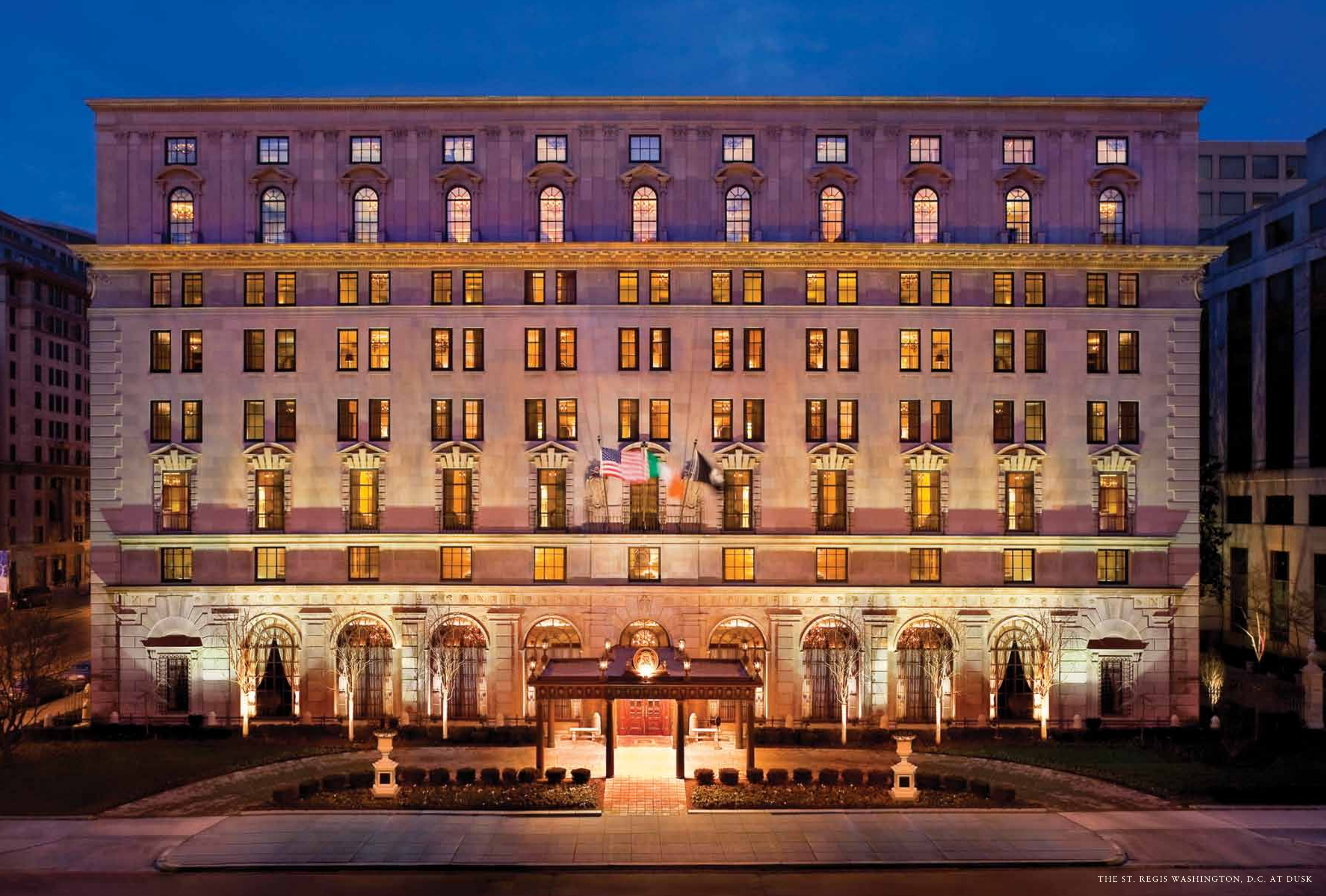
THE ST. REGIS WASHINGTON, D.C. AT DUSK