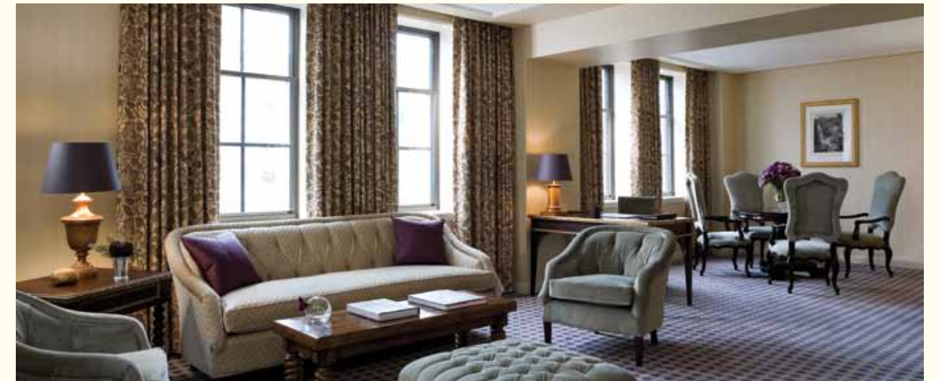
This page THE PRESIDENTIAL SUITE The largest and most lavishly appointed suite, The Presidential Suite is the very definition of comfort and opulence.