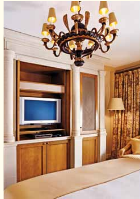
Above SUPERIOR GUEST ROOM